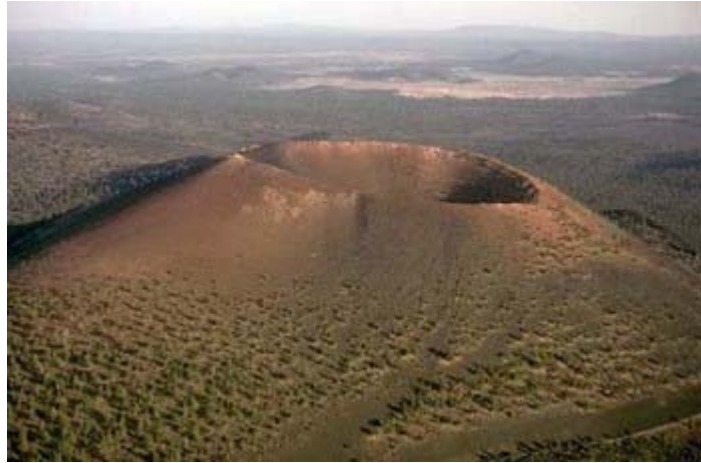
Sunset Crater National Monument in Flagstaff, Arizona. The cone is about 600 m wide and 340 m high.

indeed related, then it is likely that the Alphonsus pyroclastic deposits are about the same age. The Alphonsus pyroclastic deposits are sometimes associated with low cones that have symmetric dark 'haloes'; these cones resemble cinder cones or small volcanoes on Earth.